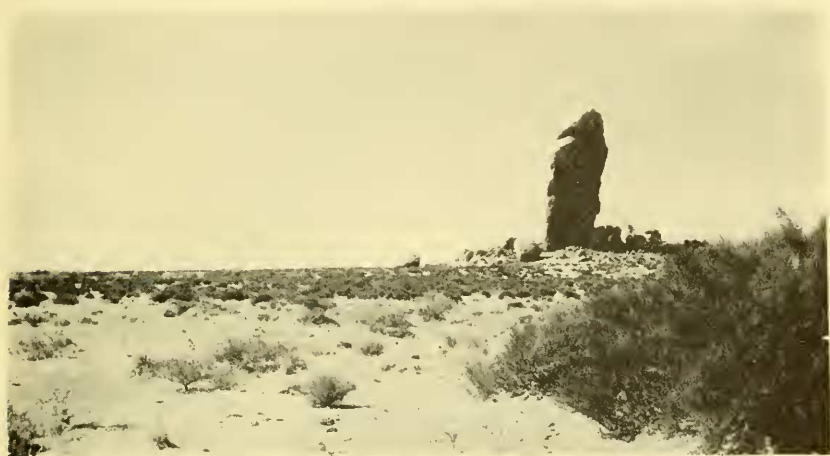
Figure 7. The Chimney Rock or Sentinel, near Willow Spring Tank. The sand dune in the right corner is being held by Ephedra torreyana . The light colored plants are Krameria and the dark colored ones in the background are Colcogyne . The Pocket Mouse, Perognathus l. arizonensis , and Kangaroo Rat, Dipodomys o. cupidiinus burrow into the sand dunes.

of acres of sandy desert around the Hall and Willow Spring Tank, (Figs. 5 & 6), at present, have a plant cover, estimated through counting various plots, which is composed of Blackbrush, Colcogyne ramosissima , 75 per cent; Krameria , Krameria glandulosa , 10 per cent;